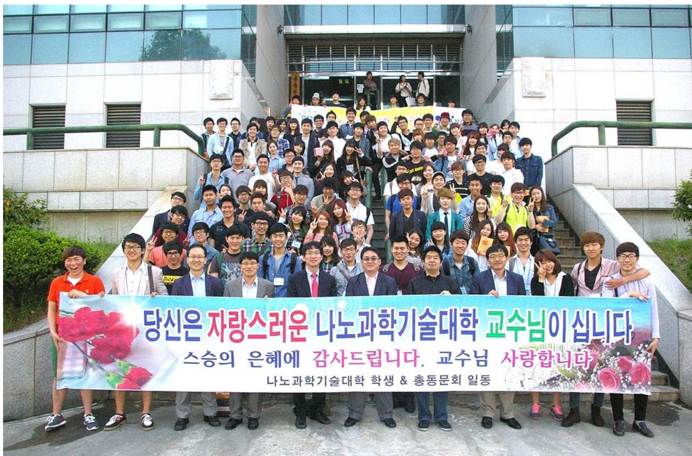
2013 Teacher's Day Celebration in the College of Nanoscience and Nanotechnology (Busan Campus, Busan, Korea, May 11, 2013)