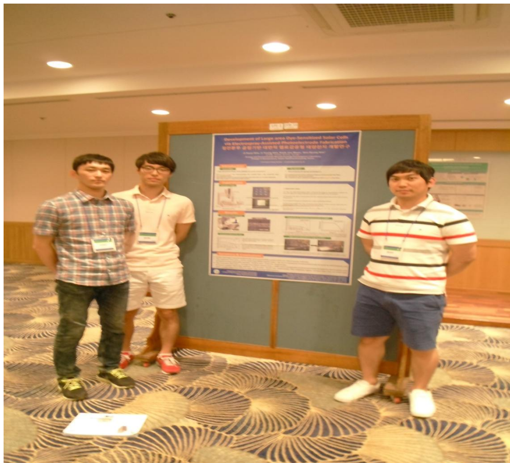
Korean Association for Particle and Aerosol Research 2013 (Gangwondo, Korea, July 3-5, 2013)