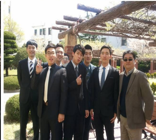
Graduation Photo Day for Seniors in the Dept. of Nanomechatronics Eng. (Busan Campus, Korea, April 11, 2013)