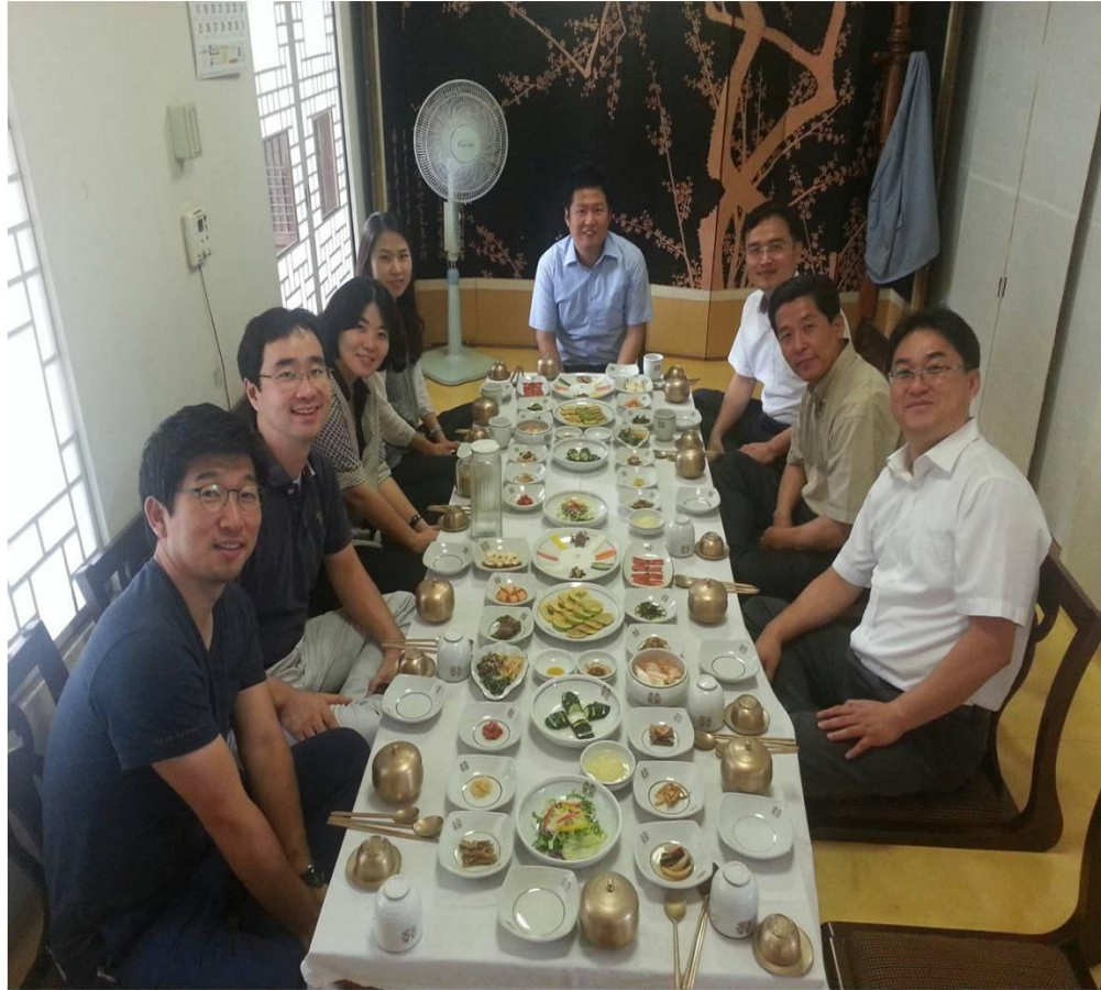
Research Meeting and Banquet with Research Collaborators from Korea Institute of Materials Science and Poongsan Research Institute (Miryang, Korea, August 30, 2013)