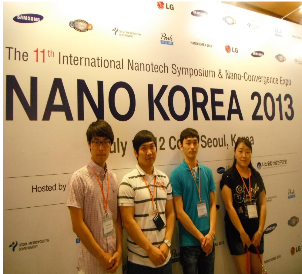
Nano Korea 2013 (Seoul, Korea, July 10-12, 2013)