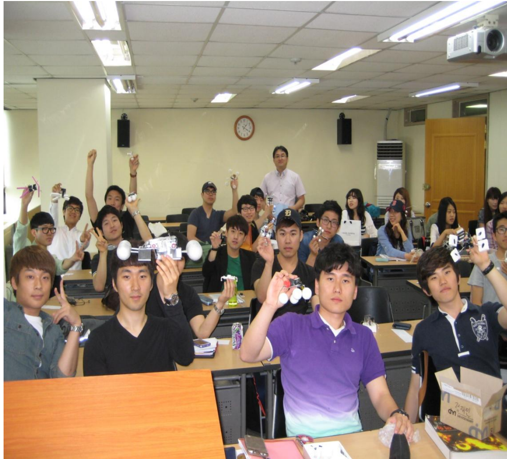
Water Strider Contest in Fluid Mechanics Class (Busan, Korea, May 30, 2013)