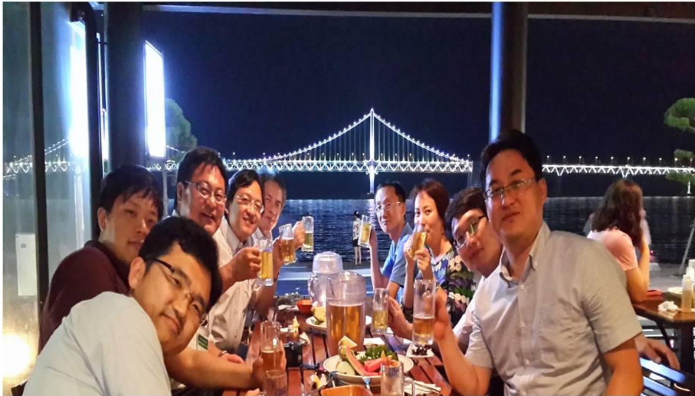
Banquet with Hiroshima University Faculties After Korean-Japanese Student Workshop (Gwanganri, Busan, Korea, August 27, 2013)