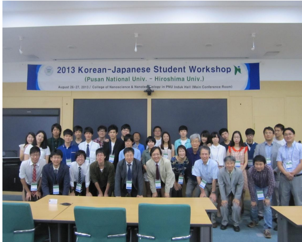
Korean-Japanese Student Workshop (Busan, Korea, August 27, 2013)