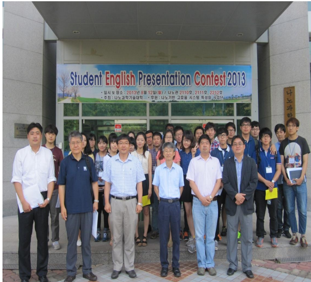
English Presentation Contest in the College of Nanoscience and Nanotechnology (Miryang, Korea, August 12, 2013)